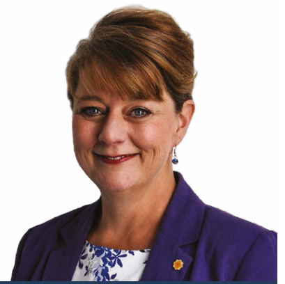
Leanne Wood, The Party of Wales Leader

It remains an unacceptable anomaly that Wales is the only nation in these islands without powers over its policing and justice policies.