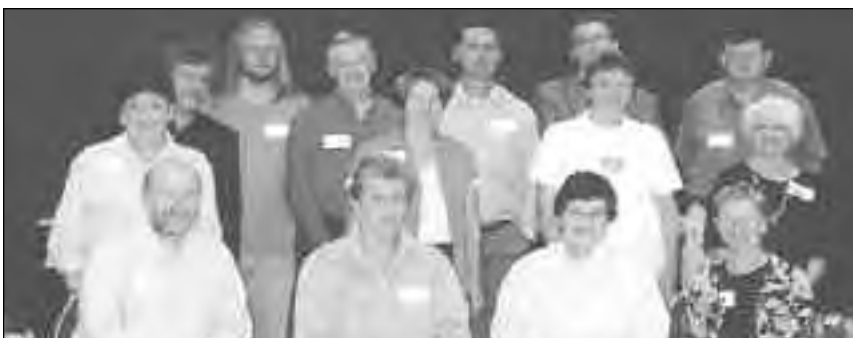
At the National Convention