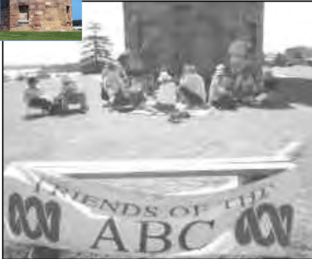
Enjoying a picnic on the grass in front of the octagonal stone fort.