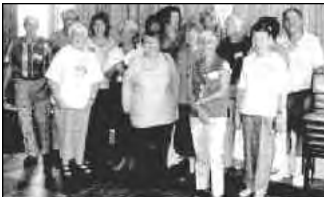
Blue Mountain Friends at a Planning Workshop held at the Katoomba Youth Hostel.