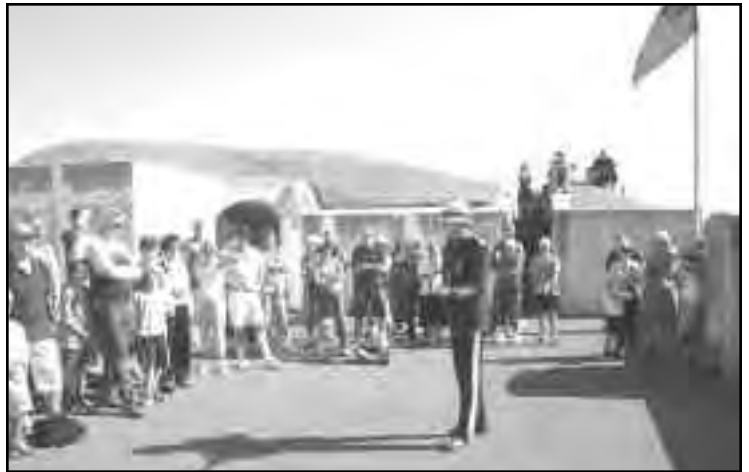
On a tour of Bare Island listening to the guide tell about Bare Island Fort which was built in 1885 both to protect Sydney's back door and to repel a possible attack on the colony's water supply in the Botany Wetlands. The fort has been used as one of the sets for Mission Impossible 2 and most recently for a Japanese game