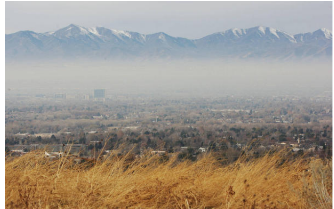
Uintah County, Utah ranks in the American Lung Association’s list of the top 10 Most Ozone-Polluted Counties. 18