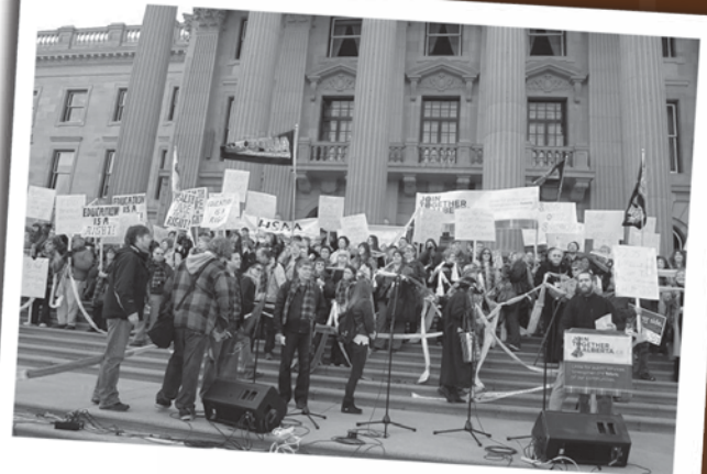
PIA helped to organize a major rally with Join Together Alberta partners on March, 19th 2010 to challenge the government to invest in public services