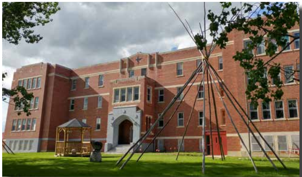
Blue Quills school

"So many of their second and now third generation out of residential school, they're not even fully aware of what that story was because when their parents came out of the residential schools, they never spoke about it.