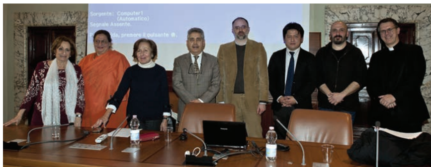
Speakers for the course on “Great Religious Traditions.” January-March 2018.