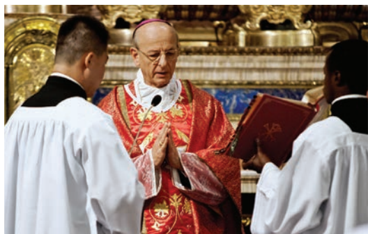
Msgr. Fernando Ocariz Braña, Grand Chancellor of Santa Croce , at the Inaugural Mass of the Academic Year. October 2017.