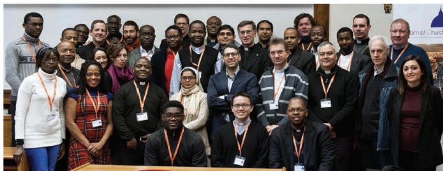
First students of the Program for Church Management. Classes began in February 2018.