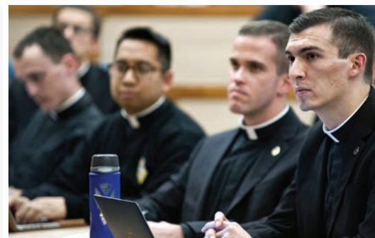
Students attending the course “Introduction to a Fruitful Participation of the Celebration of the Eucharist.” October-December 2017.