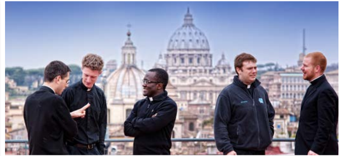
Seminarians and priests from 86 countries expand their knowledge and faith at Santa Croce , learning from fellow students and their dedicated professors.

Your gift will help shape the future of the Church to ensure that the future leaders are properly formed to keep their focus on Christ and service to the Faithful.