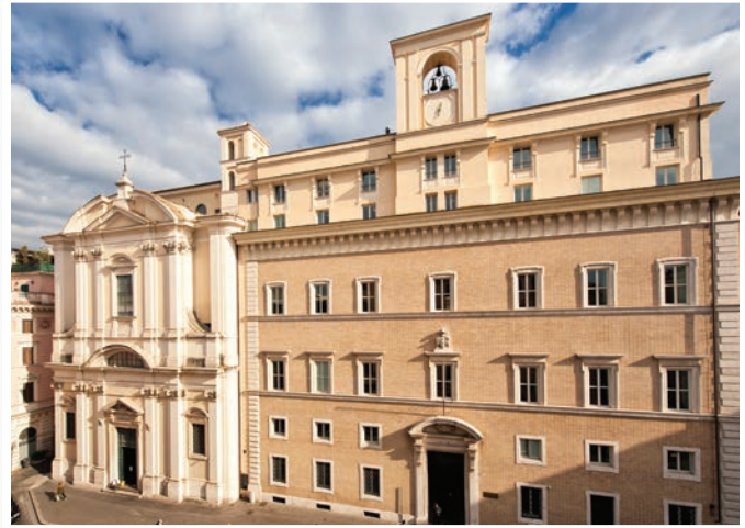
Santa Croce is located in the heart of Rome, the heart of the Catholic Church. Bishops send their most talented priests and seminarians here to become leaders for the future.