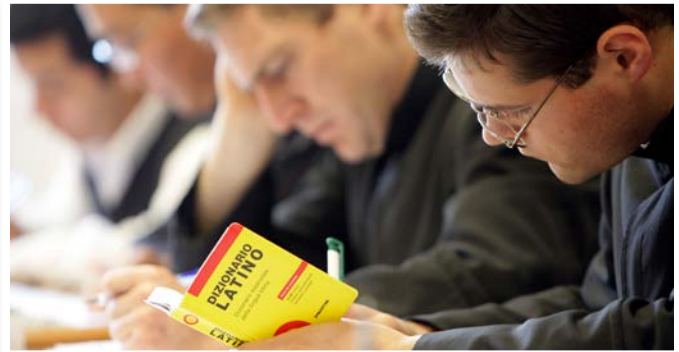
Santa Croce offers degrees in Theology, Philosophy, Canon Law, and Church Communications.

SANTA CROCE'S 1,485 STUDENTS HAIL FROM 86 DIFFERENT COUNTRIES!