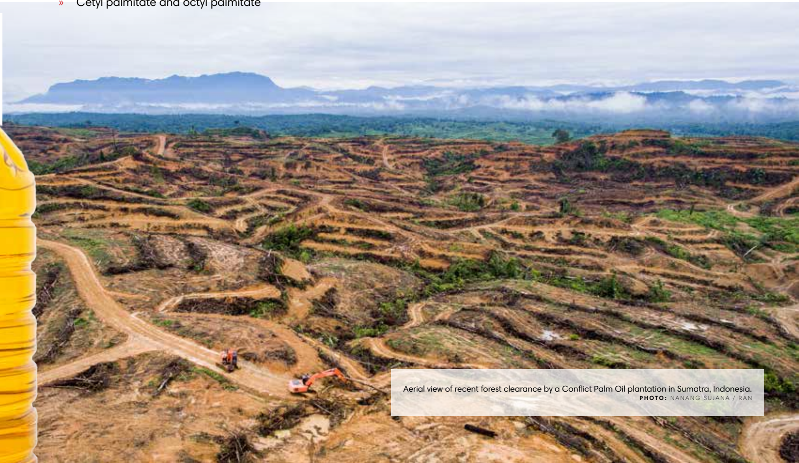
Aerial view of recent forest clearance by a Conflict Palm Oil plantation in Sumatra, Indonesia.