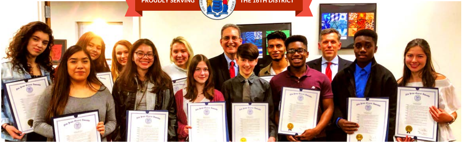
(Pictured) My district office's 4th official art show. For this evening in particular, we exhibited the beautiful artwork of Manville High School's students. Other school districts whose art has hung on our office walls thus far include Hillsborough, Hunterdon Central, and Princeton.