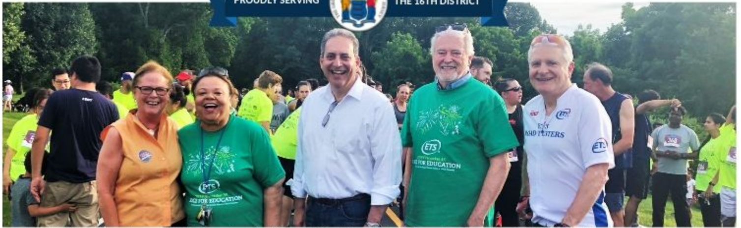
YWCA Princeton's 15th annual ETS Firecracker 5K. All proceeds benefited YWCA Princeton's Young Wonders Child Development Center—a program devoted to providing pre-schoolers of all backgrounds and language abilities a safe, nurturing, and diverse learning environment