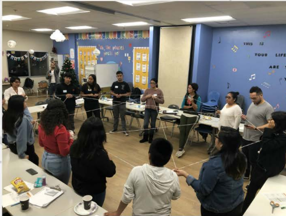
Youth webs of resilience, needs, and priorities for sustainability- Youth Nov 17th, Dec 1, 2018