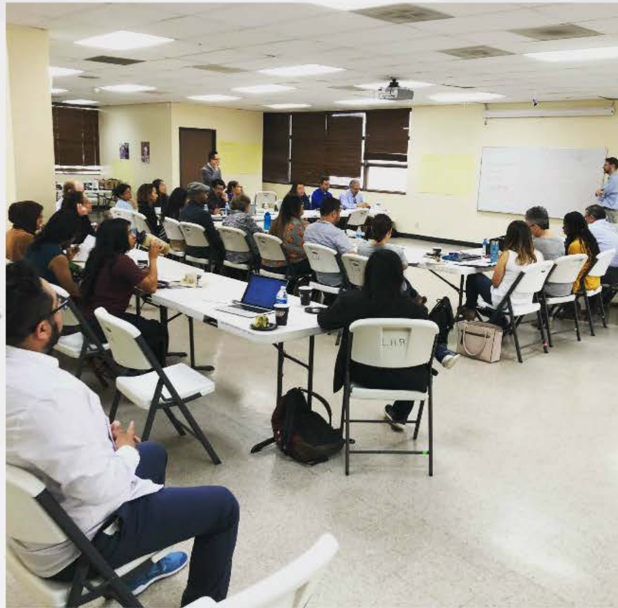
Emerging Clusters of Collaboration, Potential Roles, and Root Causes- Organizations, Sep 28th, 2018