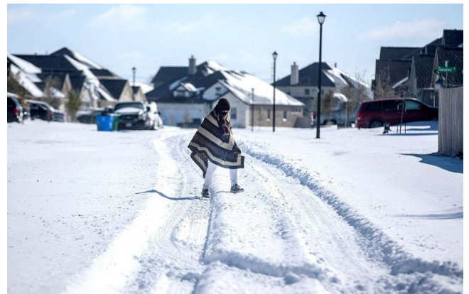
A man in Pflugerville, Texas, walks to his friend's house Feb. 15 in a neighborhood that had no electricity.