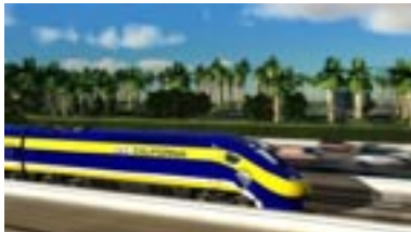
California High Speed Rail

When minority-owned businesses are allowed to compete on an equal footing in a fair and open system, they win contract awards. And when that happens, the ripple effect is astounding. Growing businesses hire workers, often from minority communities. They spend money locally and contribute to community re-vitalization. But when procurement systems are closed and insular, as bullet train projects are shaping up to be, none of these benefits are realized.