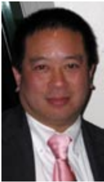
by Samson Wong

IMPACT OF OVER 10 YEARS: With 2010 census numbers being released, new redistricting panels for congress, state legislature and board of equalization will redraw political boundaries. Asian Pacific Americans (APA), while protected under the Voting Rights Act, are not automatically guaranteed seats. However, with reapportionment out of the hands of the California legislature, APAs will have to live with the new districts of 2012 for the next 10 years and beyond.