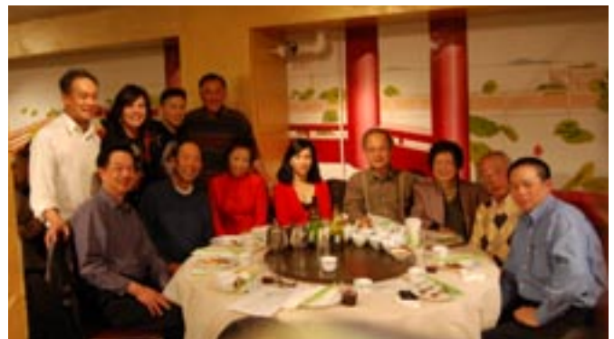
Issues Committee meeting at Utopia Restaurant