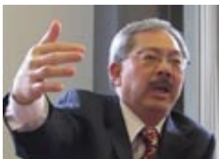
Mayor Ed Lee