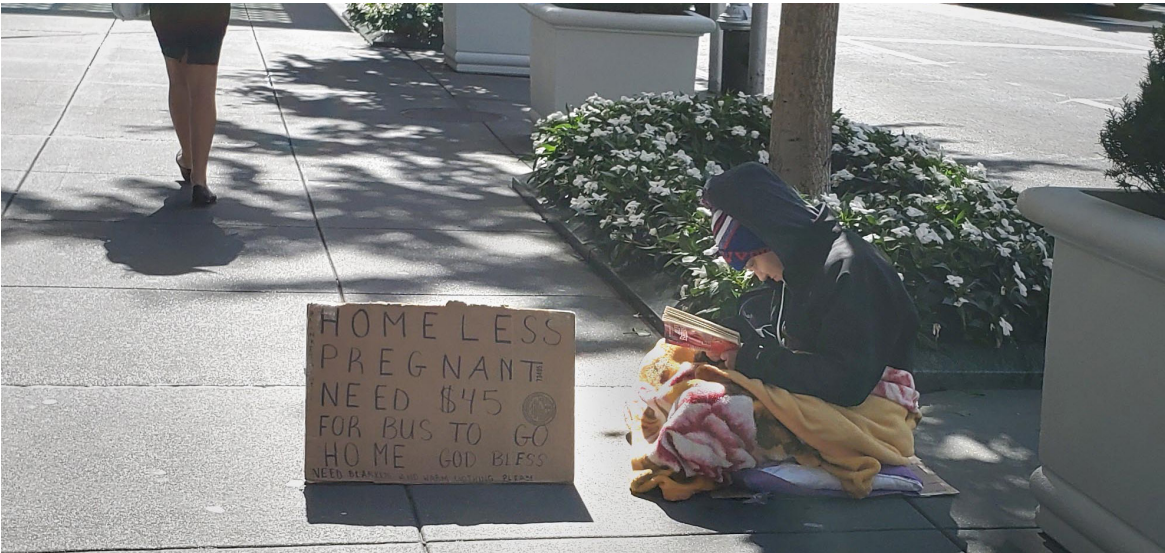
A homeless pregnant woman begging for donations on an Upper West Side Manhattan sidewalk.

of people are living in substandard housing, and housing in urgent need of substantial repair. For example, the New York City Housing Authority (NYCHA) has a backlog of $3.2 billion in needed repairs. This makes the magnitude of the crisis far beyond what anyone has admitted thus far.