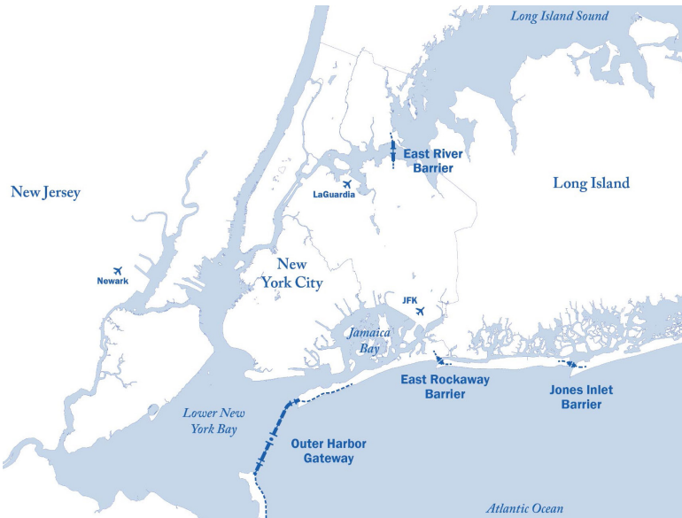
This image shows the proposed Halcrow “Outer Harbor Gateway” which spans 5 miles from Sandy Hook, NJ to the Long Island Rockaways. Also visible is the complementary East River Barrier, which would protect parts of the Bronx and Queens, and protect lower Manhattan from the two-pronged surge it experienced in Sandy.

The Outer Harbor Gateway is modeled on the St. Petersburg (Russia) Flood Prevention Facility, which was finally completed in 2010, with Halcrow coordinating the final phases of construction. The St. Petersburg project is over 16 miles long, about triple the length of the proposed New York barrier. It has a six-lane highway along the top of it, which becomes a tunnel where the large gate facility is located. In 2012, it success-