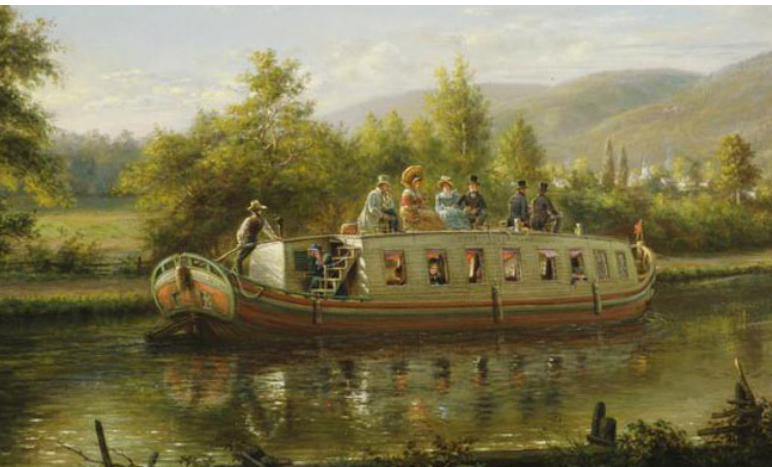
Edward Lamson Henry’s painting, “Early Days of Rapid Transit.” Travel on the Erie Canal was a gentle and pleasant experience.

The Erie Canal quickly became the development corridor Morris had foreseen and Washington had wished for. Former dense forests and impassable swamplands gave way to bustling villages, towns and cities. With the exception of Binghamton and Elmira, every major city in the state is located along the trade route established by the Erie Canal: New York City, Albany, Schenectady, Utica, Rome, Syra-