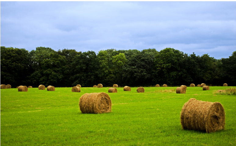
Farmland in the Midwest is some the most productive in the world, yet farmers at the recent Schiller Conference complained that they are being forced out the business of food production.