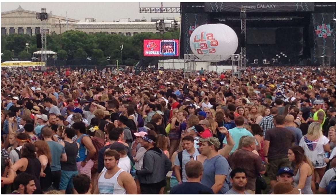
A view of the 2014 Lollapalooza Festival in Chicago's Grant Park. Earlier this month, nearly 400,000 people crowded into the park for this year's festival, looking much the same as this crowd—maskless, and oblivious to the threat of the renewed pandemic.

appears to have hit a wall at a little over 170 million. While there is no reason to doubt that vaccines, which are available for free, remain the key protection against bad outcomes from the disease, including the Delta variant, they do not guarantee that people who are vaccinated will not contract the virus. What is alarming to many health experts is the breakdown of testing, which alone can reveal asymptomatic, infected people capable of spreading the virus -- including among vaccinated people. Absent persistent mass testing, there is no way to isolate and quarantine such infected people, which is key to halting the spread. Such health experts point out that vaccinated people, who might have the virus without symptoms, become a key variant in its spread, as they attend such super-spreader events as the recently concluded mass rock concert "Lollapalooza" in Chicago's Grant Park, or Barack Obama's 60th birthday party in