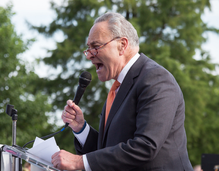
Chuck Schumer in a rare public display of passion -- perhaps someone in the audience mentioned the name "Lyndon LaRouche."