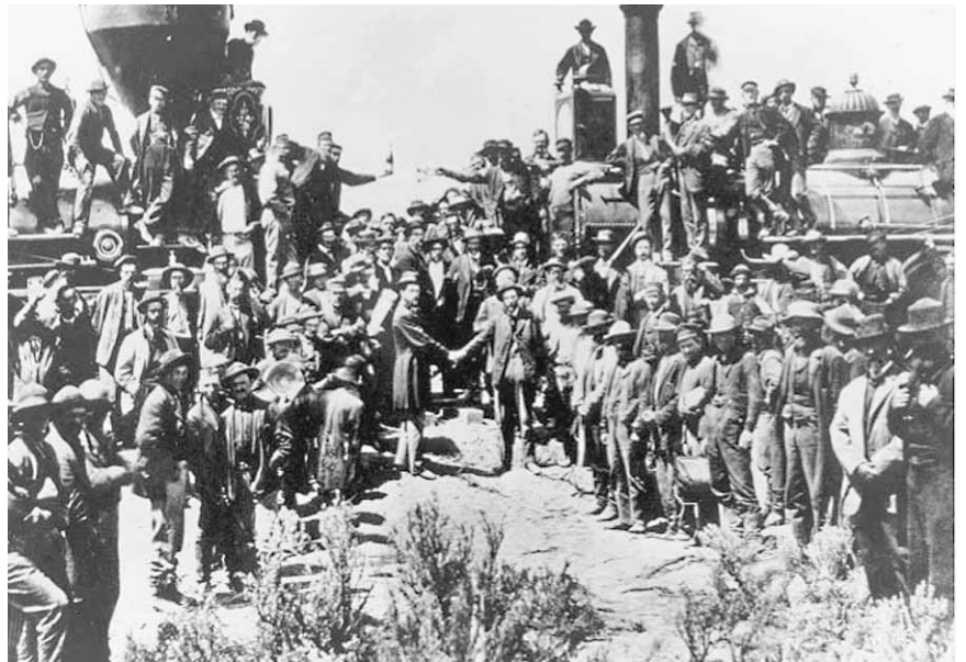
The driving of the ceremonial golden spike in Promontory, Utah, on May 10, 1869, that completed the nation's first transcontinental railway.

Since Alexander Hamilton breathed new life into our nation with the creation of the U.S. Constitution and the recruitment of George Washington to launch our new Republic as its first President, it has always been the case that the prin-