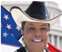
FREDERICA WILSON U.S. Congress - 24 th District