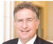
JOE GARCIA U.S. Congress - 26 th District