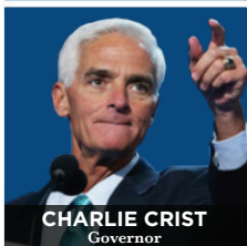
CHARLIE CRIST Governor

WE NEED LEADERS WHO WILL MAKE SURE EVERYONE GETS THE SAME OPPORTUNITIES AND FREEDOMS.