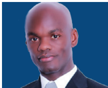
KIONNE MCGHEE Florida House - District 117