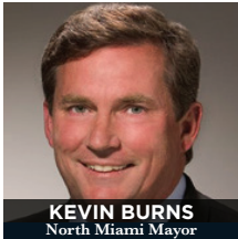
KEVIN BURNS North Miami Mayor