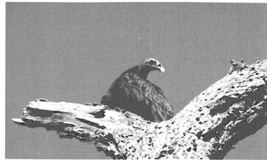
Turkey Vulture at Sunrise Riffle