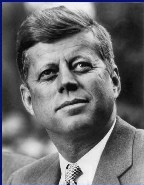
JOHN F. KENNEDY 1917-2017

"Now the trumpet summons us again — a call to bear the burden of a long twilight struggle... a struggle against the common enemies of man: tyranny, poverty, disease and war itself."