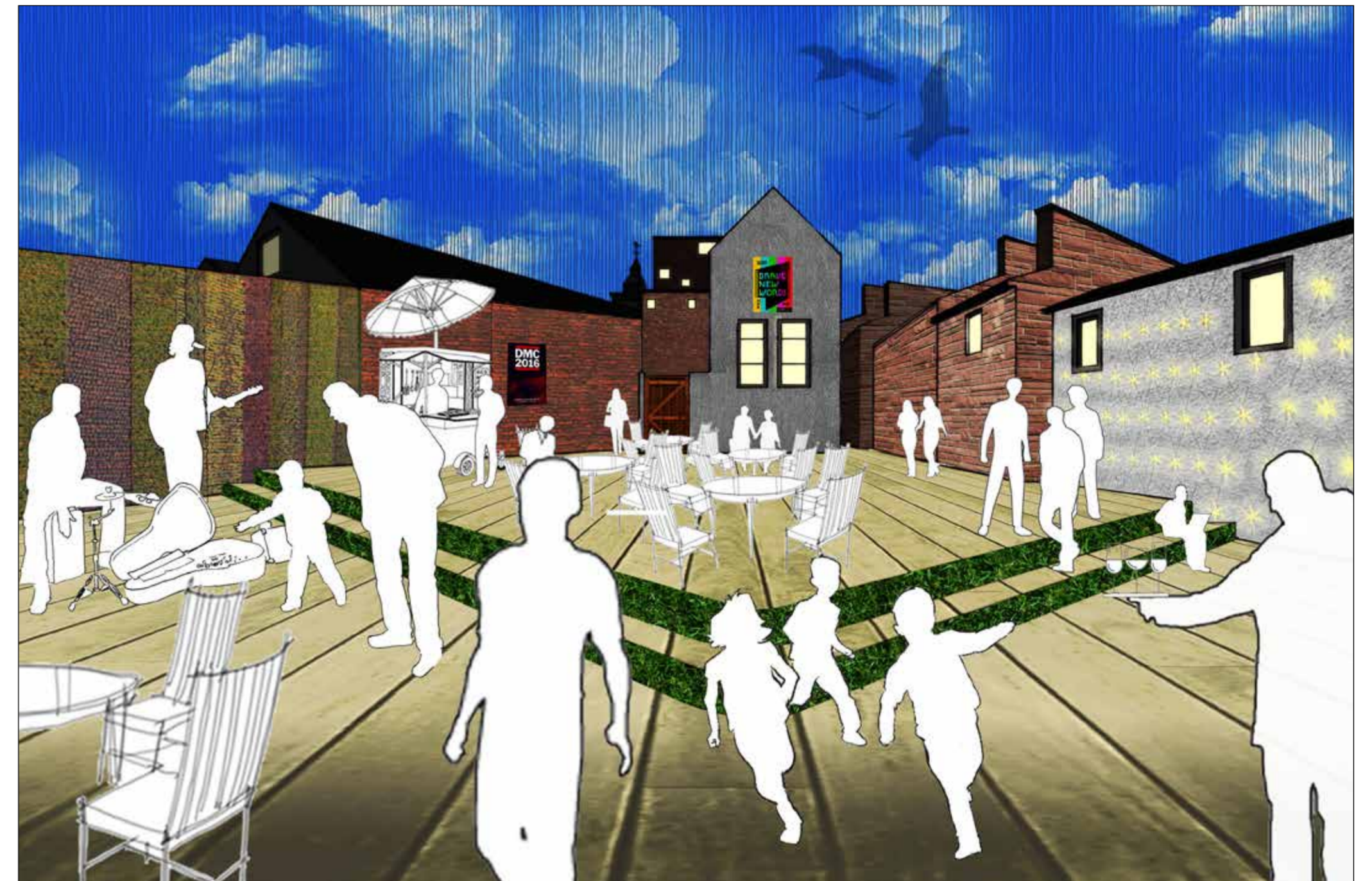
Midsteeples Quarter Courtyard