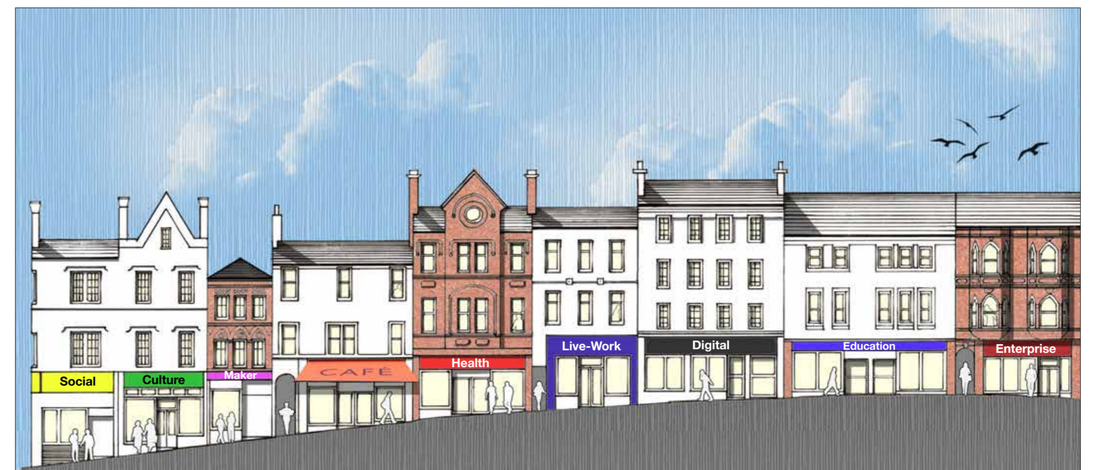
Midsteeples Quarter High Street Elevation