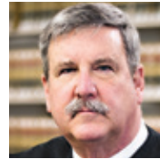
CURTIS KARNOW SUPERIOR COURT JUDGE SEAT 7