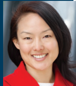
MARK LENO FOR MAYOR #1