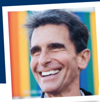
MARK LENO FOR MAYOR #1