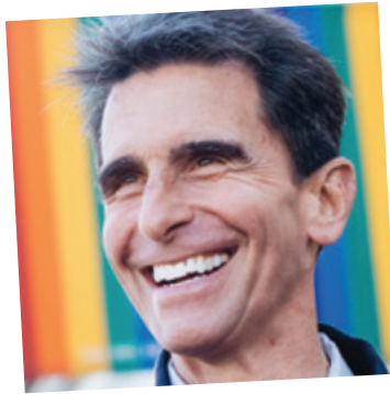
MARK LENO FOR MAYOR #1

The leadership, experience, and integrity we trust to unite San Francisco and tackle our toughest problems. Endorsed by U.S Senator Kamala Harris, SF teachers and the Sierra Club.