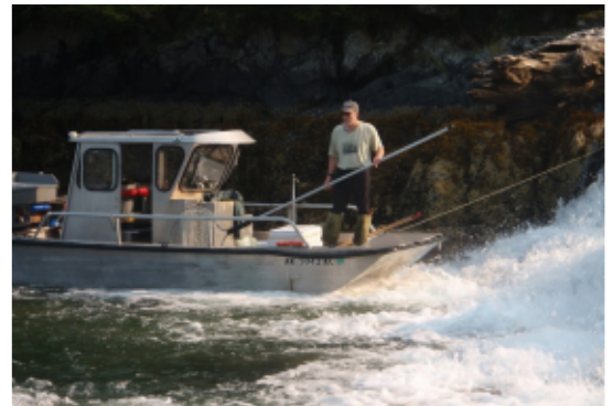
A fisherman dips nets for subsistence sockeye at Redoubt Falls.

Sealaska claimed 11 acres immediately adjacent to Redoubt Falls as a "historical site" under the Alaska Native Claims Settlement Act in 1975, but the conveyance was held up for decades by private claims to the property. All private claims have now been resolved, and the Bureau of Land Management is in the final stages of the conveyance process. If the Redoubt Falls site met the definition of "historical site" under ANCSA, and there were graves, petroglyphs or archeological evidence to suggest it was an important cultural site to Alaska Natives, the SCS would be sensitive to the Sealaska claim. However, Forest Service archeological reports show no evidence of a seasonal fish camp, nor any historical Native inhabitation on the site. Instead, archeological reports reveal the 11 acres claimed by Sealaska to contain one of the most intact Russian archeological sites in North America. SCS has submitted legal memos to the Forest Service and BLM arguing the site does not meet the legal definition of "historical," and that a "fisheries exception" in the code, which requires the Secretary of Interior to prevent conveyances which "could" result in the harm to a fish population or fisheries management, should prevent the conveyance.