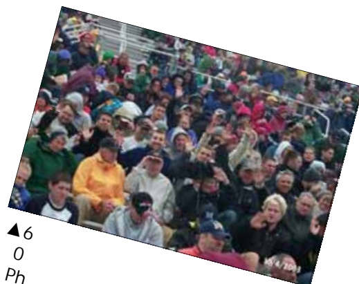
▲6 0 Ph