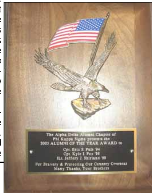
The 2003 "Alumni of the Year" plaque

Skullumni recognizes that these three Brothers, and the men and women they serve