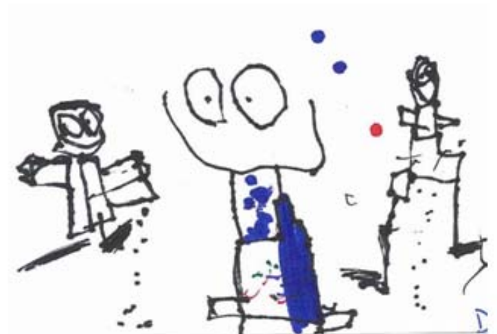
Drawing of Illustration by Devin