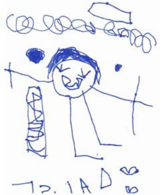
Illustration by Shataysia