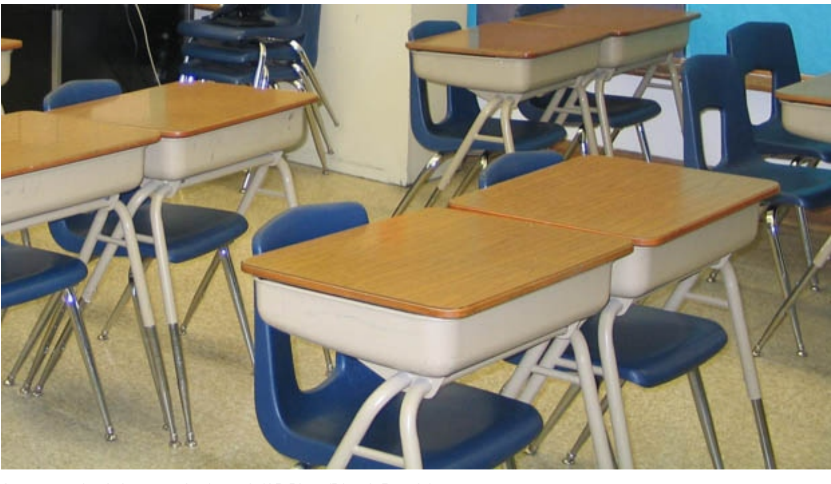
An empty school classroom is pictured.