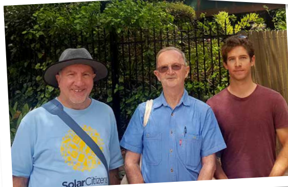
PHOTOS (ABOVE): South Australian volunteers door knocking, letterboxing and hosting stalls in the lead up to the state election..