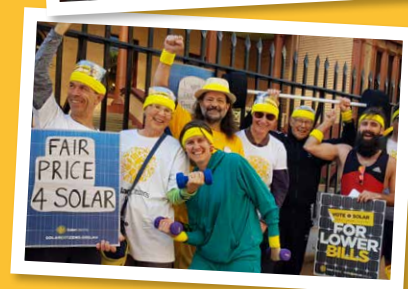
PHOTOS: Volunteers outside of NSW Parliament House for the Keep Solar FiT stunt.