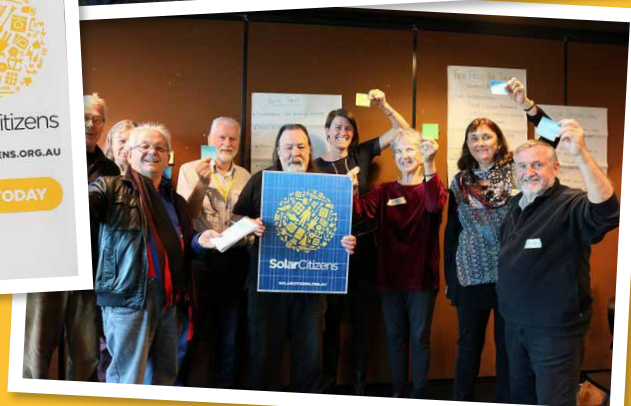
PHOTOS (ABOVE AND RIGHT): NSW volunteers at community stalls and strategy meetings.