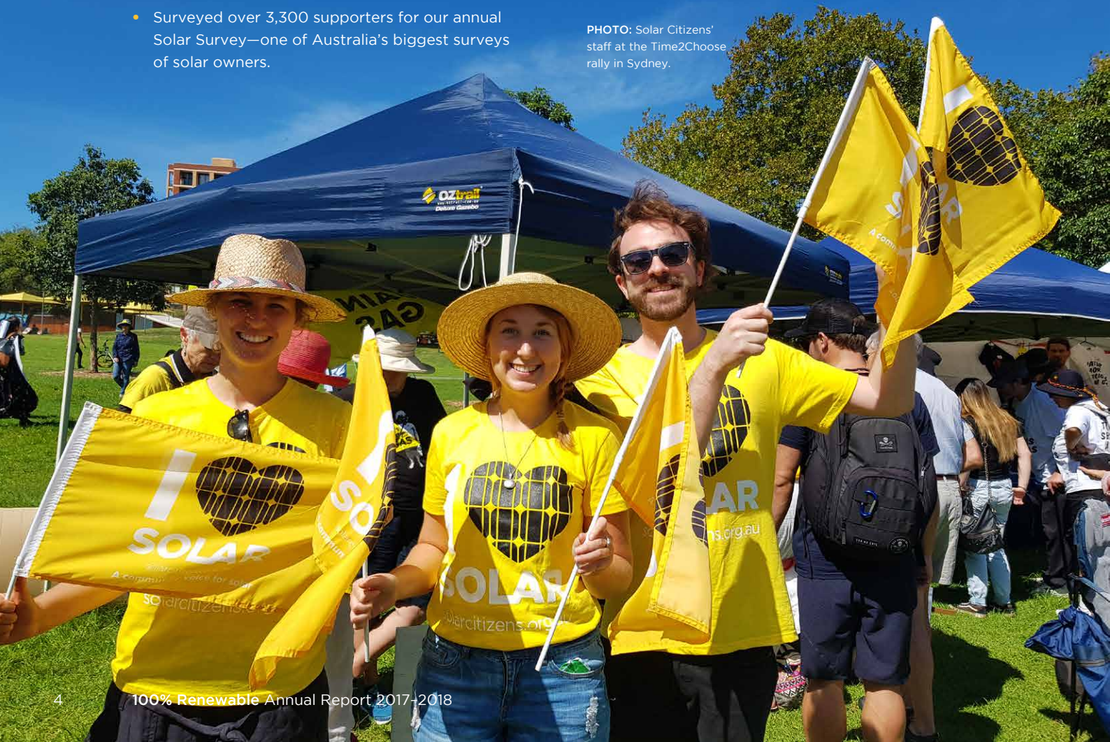
PHOTO: Solar Citizens' staff at the Time2Choose rally in Sydney.