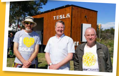
PHOTOS (TOP): NSW volunteers participating in the Keep Solar FIT stunt.