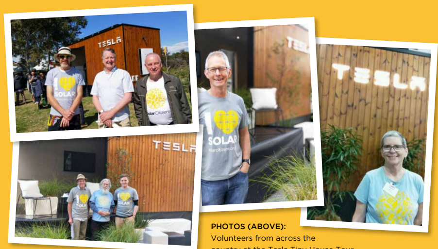
PHOTOS (ABOVE): Volunteers from across the country at the Tesla Tiny House Tour.

Along the way Solar Citizens grew our network of solar supporters; activating and engaging 49 volunteers in QLD, NSW and SA, and signing up close to 1000 new supporters.