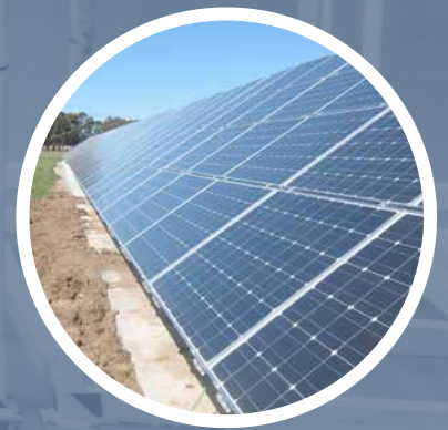
PV framing manufacturing in Salisbury South Australia

But this will only happen if the Renewable Energy Target is kept strong.