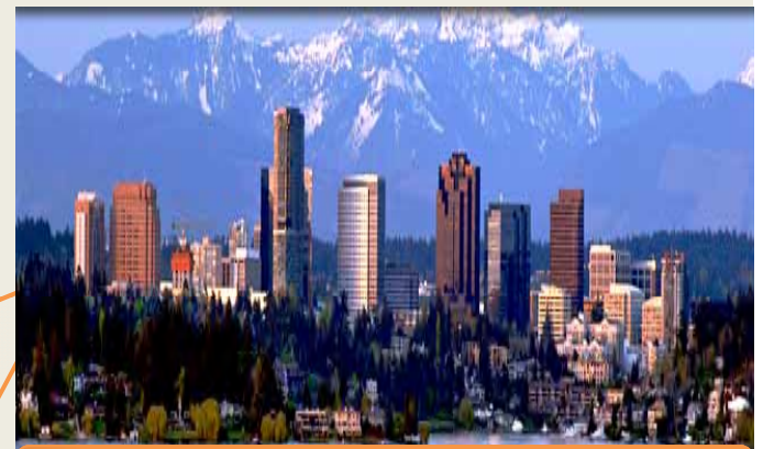
Bellevue/Puget Sound Energy