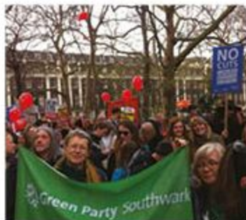
Southwark Greens supporting #OurNHS

Why is the government charging nurses to train, when we have a national shortage? Why is it paying private agencies millions for temps, instead of recruiting permanent staff and making sure their working life is sustainable? The Green Party believes in an NHS that looks after us all. We would pay for it through a fair tax system. 60% of people in a recent poll said they thought corporations should pay more tax. Do you agree?