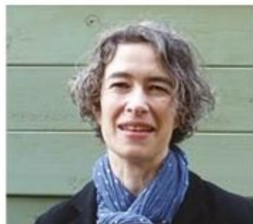
Eleanor blogs about local issues at southcamberwellgreens.wordpress.com