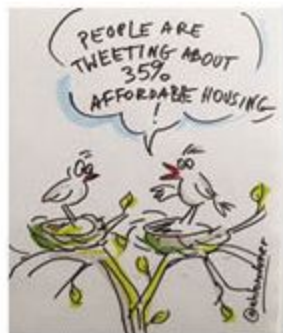
Local residents challenge developers' figures