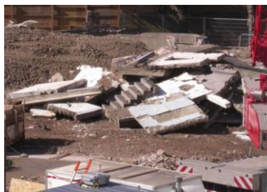
Demolition of the Heygate Estate