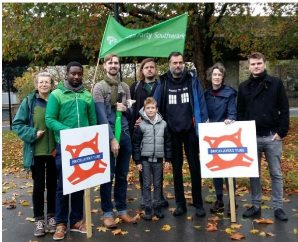
Greens at the Bricklayers tube rally

We recorded illegal levels of nitrogen dioxide in Dulwich Village