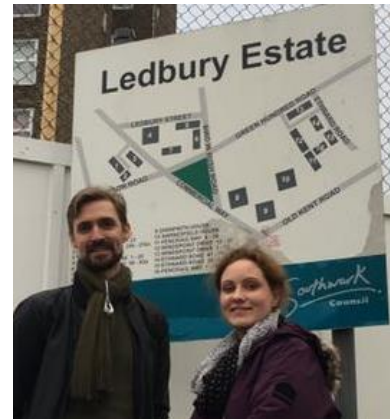
Working with Ledbury residents

On the Ledbury estate in Peckham, successive councils ignored residents' concerns over building safety. An engineers' report finally commissioned this year found that the four blocks were at risk of collapse from a gas explosion. 71% of residents surveyed were dissatisfied with the Council's response.