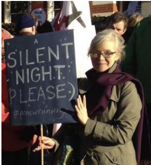
Campaigning, with HACAN, against more planes over Southwark