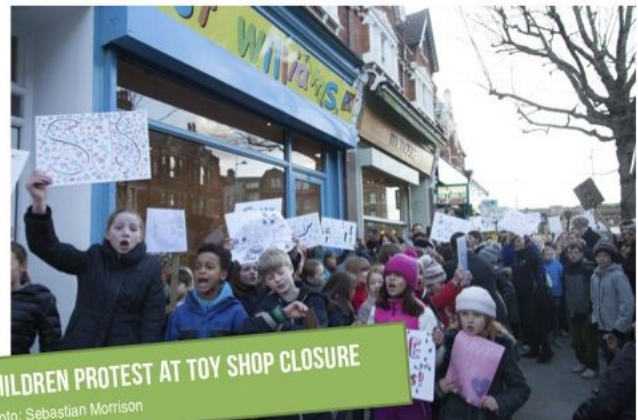
CHILDREN PROTEST AT TOY SHOP CLOSURE

By its actions the Dulwich Estate, along with Network Rail, has forced local businesses in the railway arches to close – benefiting its own narrow interests rather than the local community as a whole. But the fantastic response of local residents, supporting local businesses like Just Williams and the Half Moon pub, shows that we will not take these changes lying down.