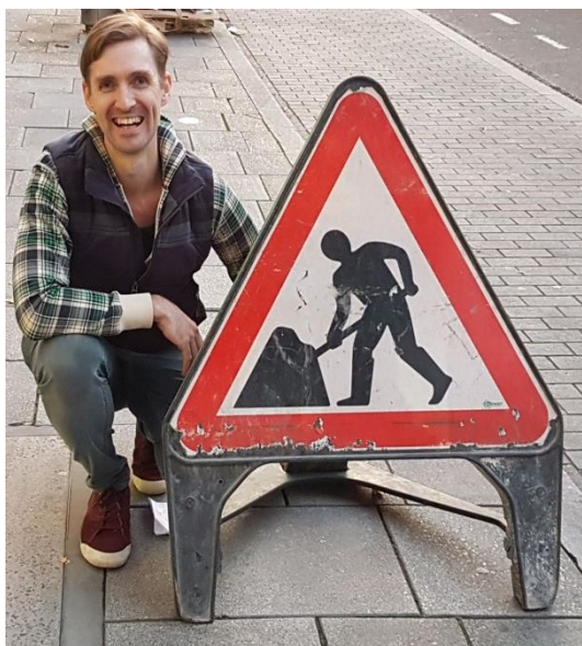
GREENS at work