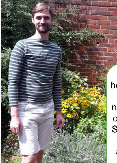
Rockingham in bloom

We've been helping Rocking Village plant new flower beds on Rockingham Street – reviving plant diversity and improving air quality