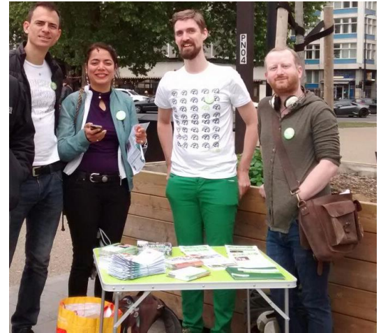
Campaigning for Housing in Elephant & Castle