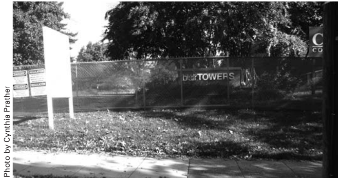
Current construction site at Blair Towers.

S hepherd Park is about to have new neighbors. Part of The Blairs apartment complex that borders our community along Eastern Avenue will begin redevelopment early next year.