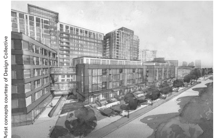
New Blair Towers artist concept.

For more information contact construction@blairapartments.com .