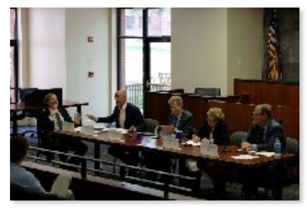
Panel 2: "What consumer protections should accompany legislation?"