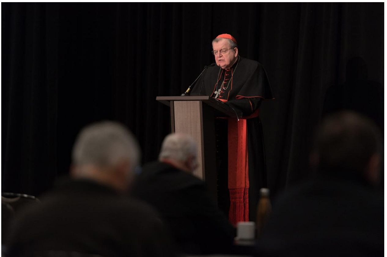
His Eminence Raymond Leo Cardinal Burke

Cardinal Raymond Burke opened the Faithful Echo priest conference with the first session entitled The Holy Priesthood: Participation in Christ's own pastoral charity . In this beautiful address, His Eminence discussed with his brother priests how important it is and how the essential role of the priest is to be in the person of Christ not only on the altar but to be Christ in all situations. The love that the Sacred Heart of Jesus has for every single soul is the love that the priest must have for each soul that he meets, each soul that is in his care.