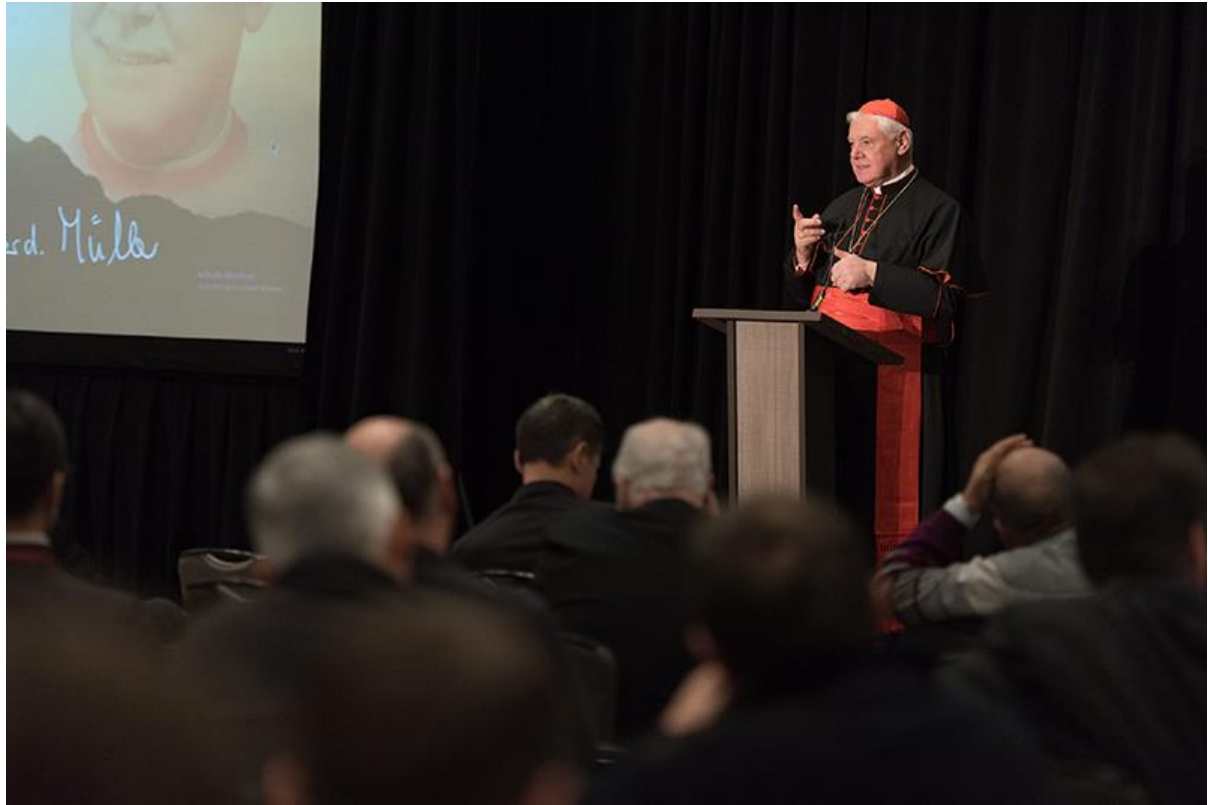
His Eminence Gerhard Ludwig Cardinal Müller during his speaking session titled: You Shall Be a Blessing

His Eminence Cardinal Gerard Ludwig Mueller then followed with a session just before lunch entitled You shall be a blessing highlighting the importance of the priest's role in maintaining Fidelity to the unchanging teachings of the Catholic faith without wavering, without watering them down. As Cardinal Müller stated: A priest must always stand firm for Our Lord Jesus Christ, for what our Lord taught and teaches through His Church. For the benefit of the attendees, a special screening of the film Manifesto of Faith was part of Cardinal Müller's session.