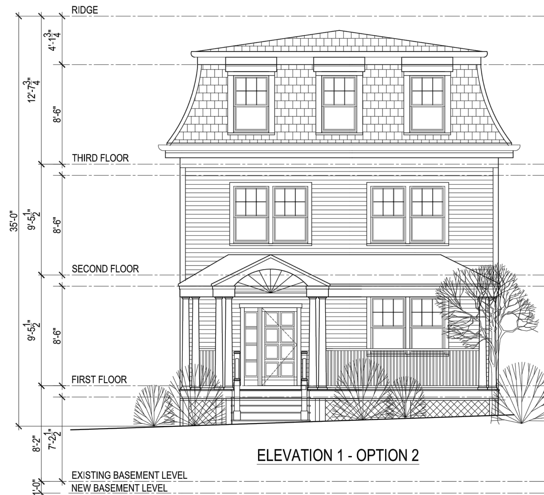
ELEVATION 1 - OPTION 2