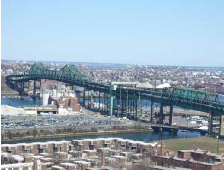
All-electronic tolling has begun on the Tobin Bridge and could soon come to the Massachusetts Turnpike.

previously estimated that all-electronic tolling will save the Commonwealth more than $50 million per year starting in FY16. Installing all-electronic tolling systems is also expected to reduce traffic congestion, increase safety, and decrease air pollution.