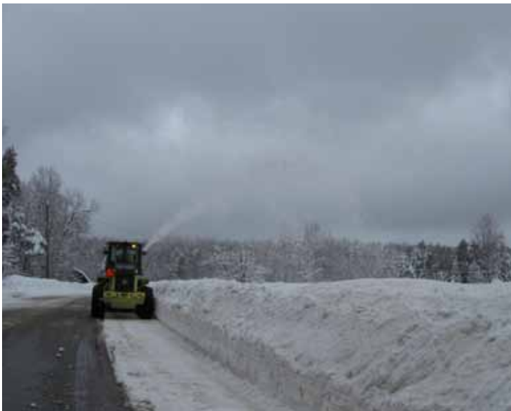
Costs for snow and ice removal have been higher than projected and are likely to continue to strain transportation budgets in the years to come.