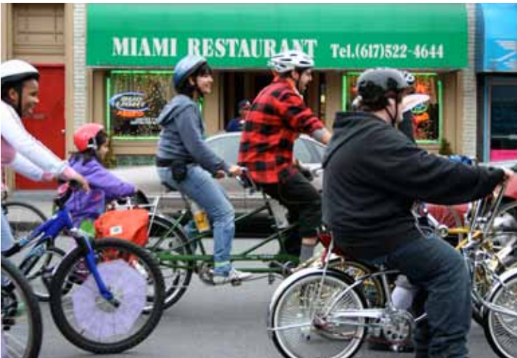
Encouraging the use of active modes of transportation, such as bicycling, is a key goal of MassDOT's GreenDOT initiative.