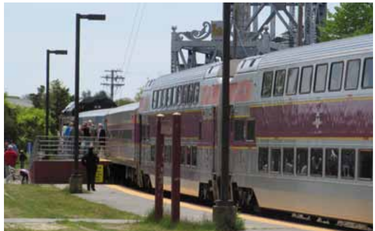
Revenue from the Transportation Finance Act enabled the addition of a new stop on the CapeFLYER, the seasonal rail service between Boston and Cape Cod.

Even without sufficient revenue available for additional capital projects in FY14, MassDOT and the MBTA were able to begin a number of capital improvements. These rely on the new revenue from the Transportation Finance Act of 2013 that will be available in the coming years. For