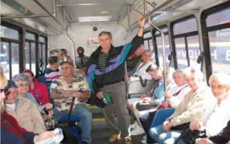
The Commonwealth's Regional Transit Authorities are in the midst of developing comprehensive service plans to help them better meet future transit needs.

reflects MassDOT's mission to provide a safe and reliable transportation system, strengthen the economy, and improve the quality of life across the Commonwealth.