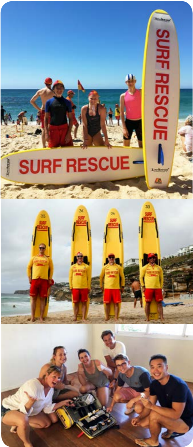
Above left: The State Government CBP (Community Building Partnership Program) grant was used to part pay for essential roof repairs Above: The Federal Government BSEF (Beach Safety Emergency Fund) grant was used to purchase six new rescue boards (four full size Bennett epoxy boards and two ¾ size soft Dolphin rescue boards) and a new Oxygen Resus Unit