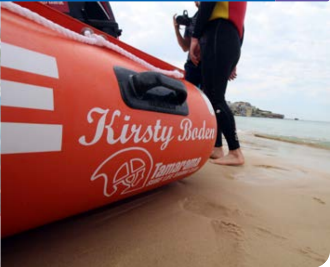
The new 'Kirsty Boden' IRB sponsored by Bendigo Bank