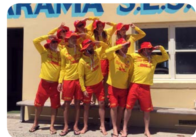
Below: Our 2017/2018 Spring bronzies