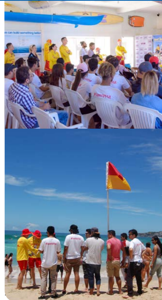
Left: Each session, members from different migrant communities receive theoretical and practical instruction on beach safety