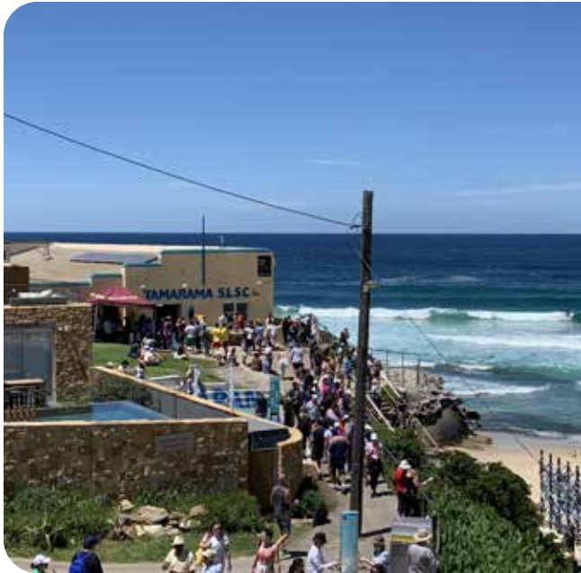
Crowds lining up for Tamarama world famous sausage sizzle (no Bondi wieners).

These are our patrol statistics for the 2019-20 season: