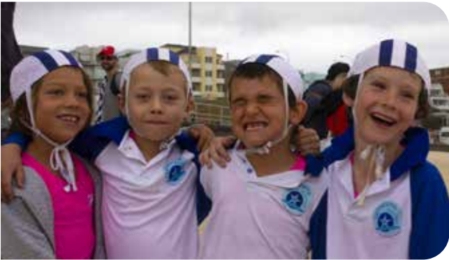
Tamarama SLSC families love Waverley Shield.