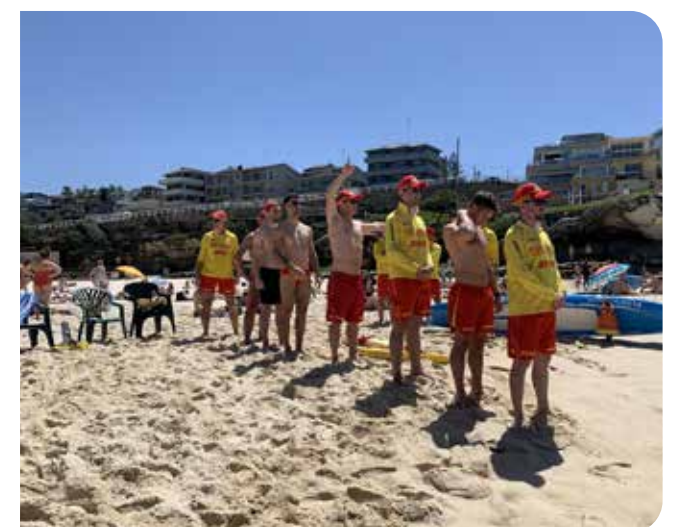
Opposite page – Above: A sign to behold – our beach closed off. Below: Patrol 8 eagerly awaiting their next challenge.