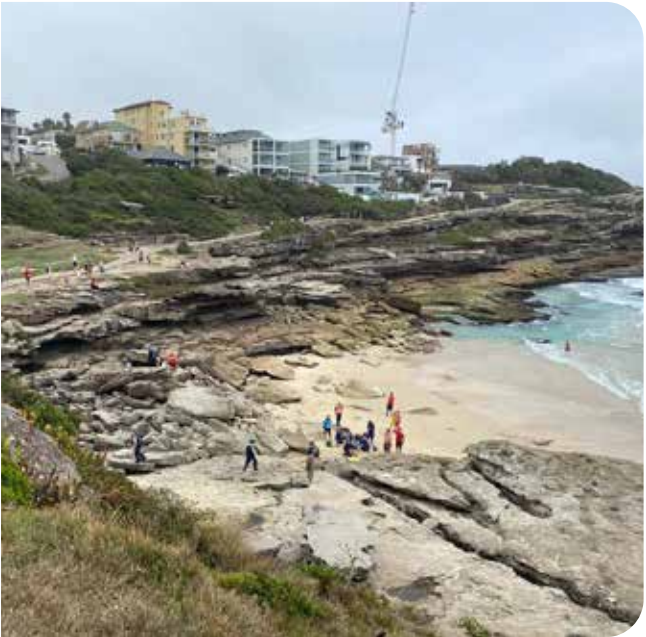
Keeping Mackenzies safe.