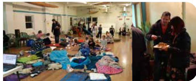
Above: Patrol 9 and their SRCs welcome beachgoers with some hi-jinx. Middle: What would we do without our SRC water safety on a Sunday morning? Thanks Guys...you're AWESOME! Below left: middle: Kids getting comfy at our Nipper Winter Movie Night. Below right: Parents getting social with some good food, wine and friends.

These skills will be vital for board rescues and future training for their Surf Rescue Certificate and Bronze Medallion.