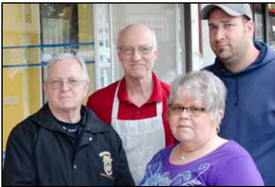
MCC Teamsters with the owner of the Sky River Bakery in Monroe

Newspaper ads, radio spots, and op-eds highlight small business support