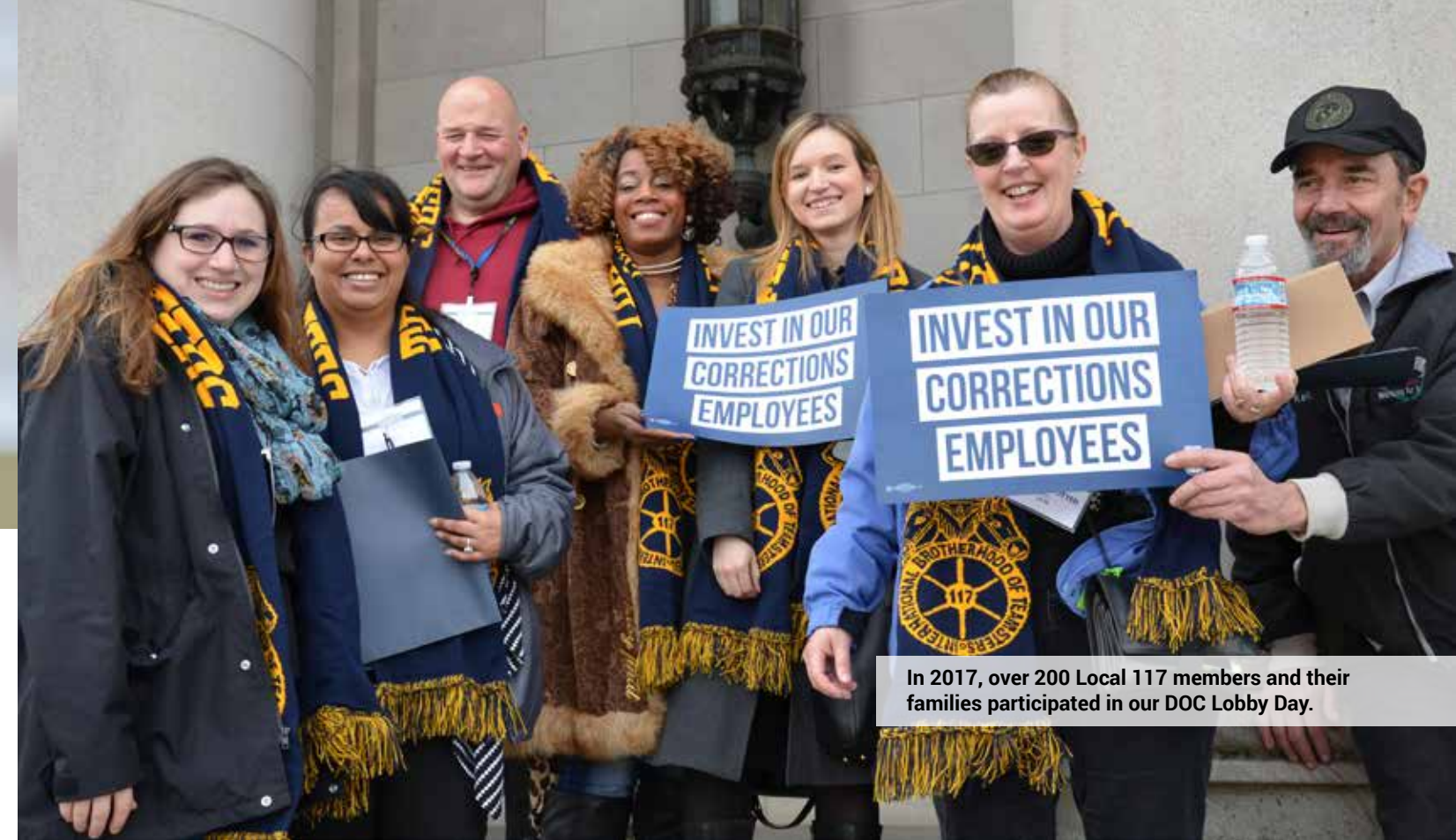
In 2017, over 200 Local 117 members and their families participated in our DOC Lobby Day.