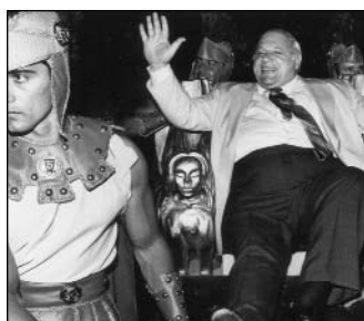
Teamster President Jackie Presser makes an entrance at the 1986 IBT Convention

By the mid-1980s, top Teamster officials were pulling down salaries of up to $609,000. Indexing this to the cost of living, that would be $1.28 million in today’s dollars!