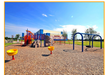
La Academia de Estrella Playground