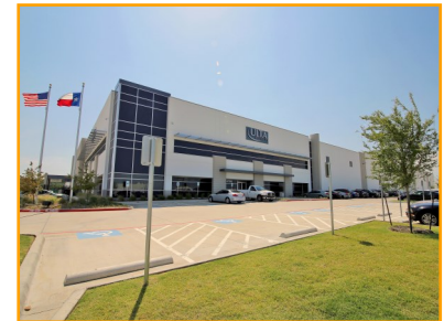
Ulta Beauty Warehouse & Distribution Facility