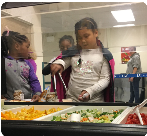
Pictured above: Children at Muskegon Public Schools. The lettuce and broccoli in the salad bar that day were Michigan-grown.