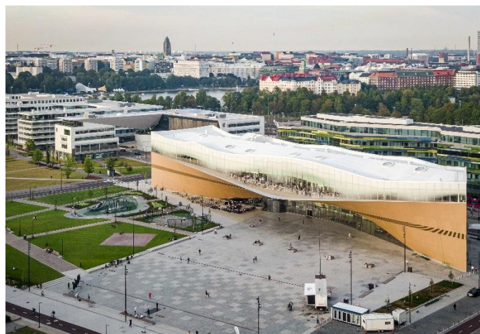
Above: Oodi library in Helsinki 5

Finland's library system is second to none. Finnish libraries are an important part of civic culture, and are the second highest rated public service in the country after drinking water. 1 The Finns are among the most avid library users in the world, so much so that libraries are referred to as "citizens' living rooms". 2 In 1994, the Helsinki City Library became the first public library in the world to be connected to the internet. 3 Since then, libraries across Finland have invested in new technologies to ensure libraries remain relevant to Finnish citizens. In 2016, the UN named Finland the world's most literate nation. 4