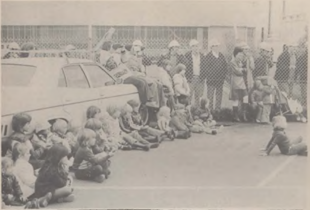
Wives and children of Union Carbide workers showing support for the factory occupation in support of a 35-hour week