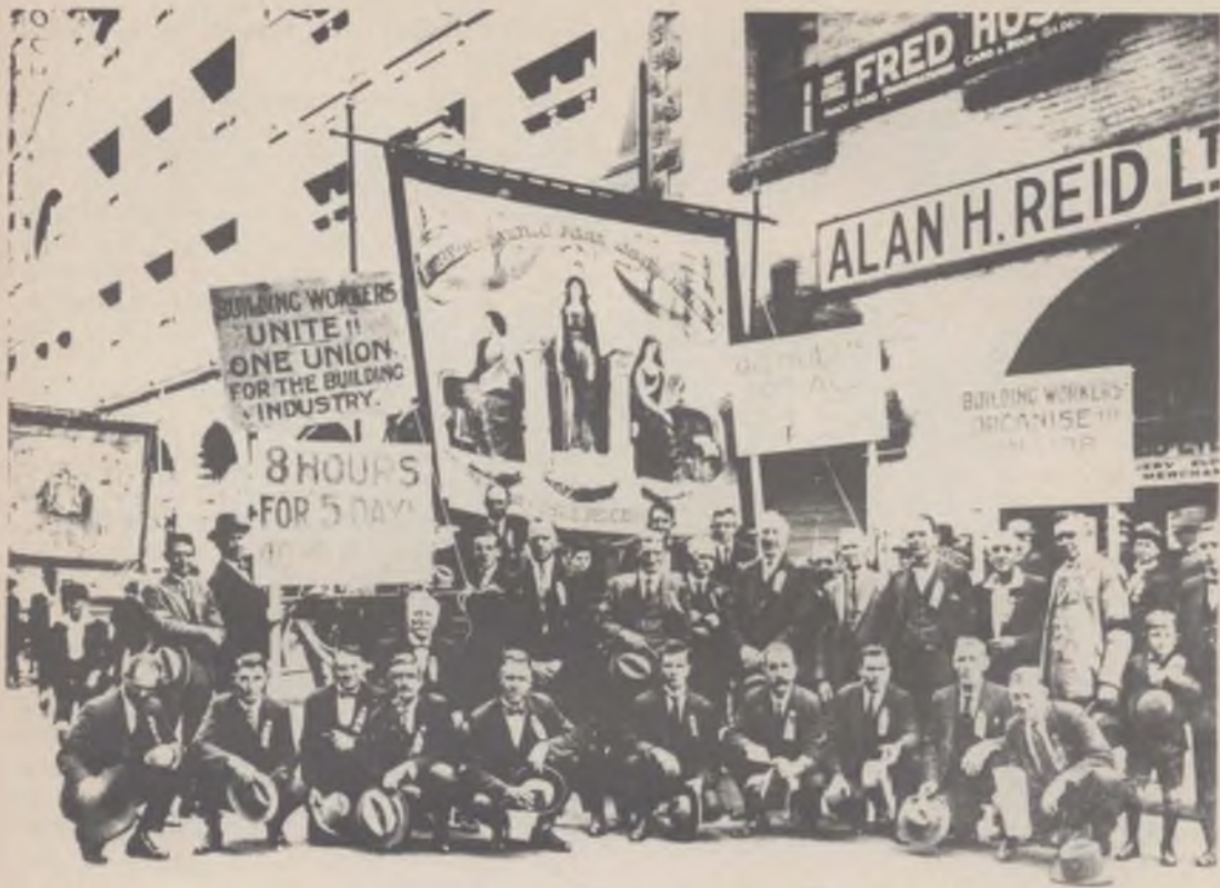
Building workers strike for a 40-hour week in 1920

to divide workers and isolate their organisations.