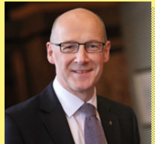
John Swinney stopped the Treasury cutting the Scottish budget by billions