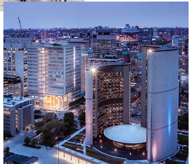
Architectural renderings courtesy of Renzo Piano Building Workshop