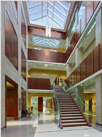
Elgin County Courthouse Atrium St. Thomas, ON