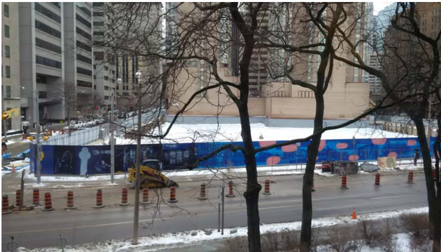
View from Armoury St., January 2018