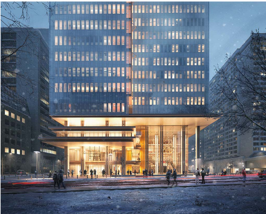
Architectural rendering courtesy of Renzo Piano Building Workshop