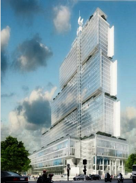
Palais de Justice Paris, France

The new Toronto courthouse is RPBW's first project in Canada.