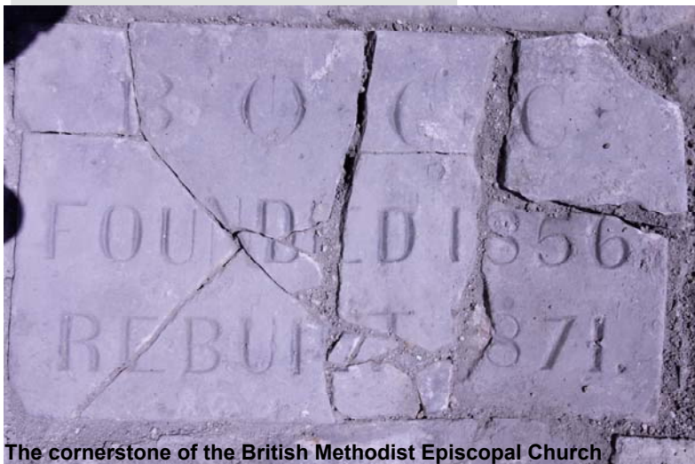
The cornerstone of the British Methodist Episcopal Church