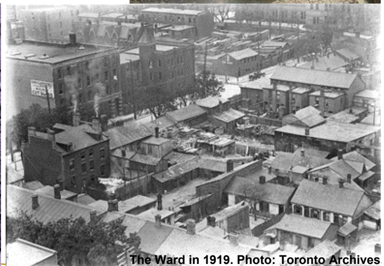
The Ward in 1919.